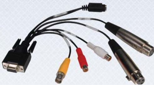
Input Breakout Cable